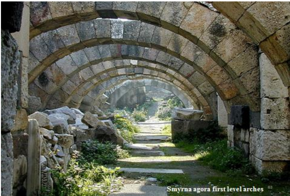
Smyrna agora first level arches